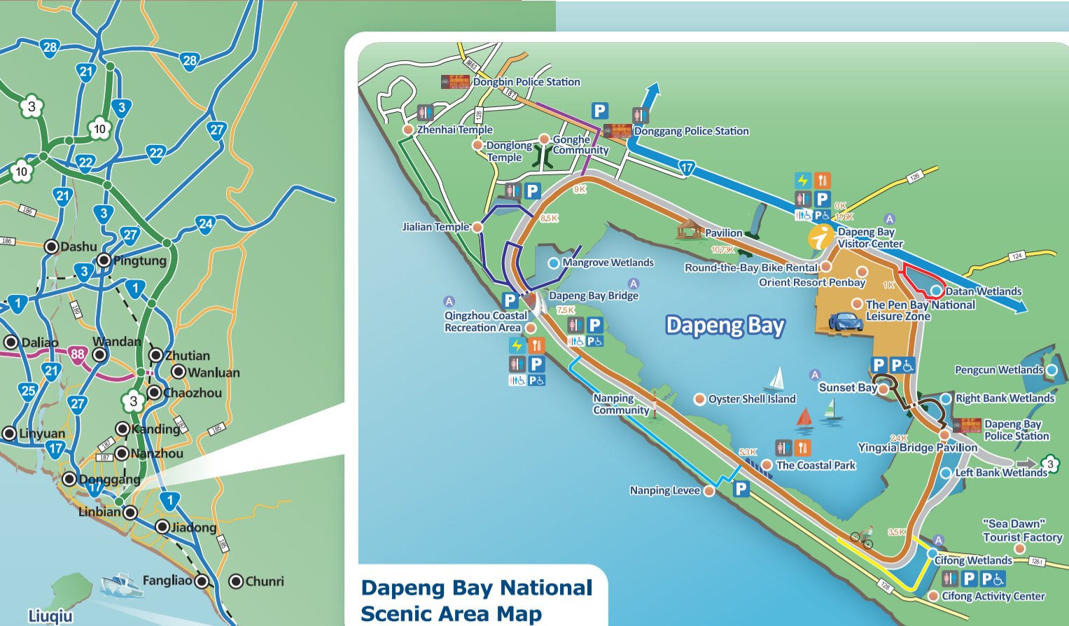
Dapeng Bay National Scenic Area Map