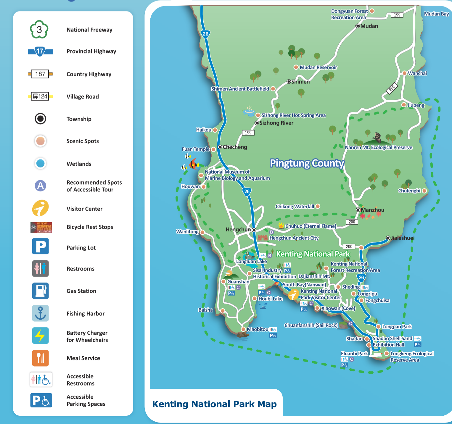
Kenting National Park Map