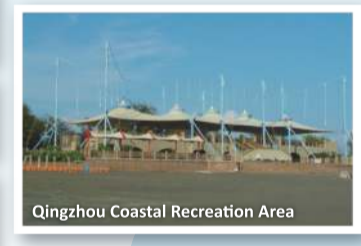
Qingzhou Coastal Recreation Area

The Qingzhou Coastal Recreation Area is close to the Dapeng Bay Bridge. Here, visitors can enjoy walking along the soft sandbank, riding an ATV, or experiencing jet skiing. Alternatively, visitors can enjoy a cup of coffee at the "631 Coffee Shop," which is the best place for watching the bridge-opening show.