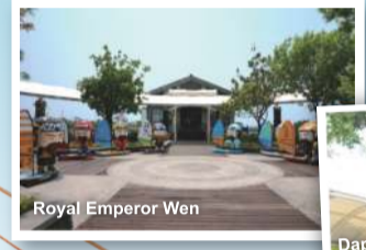
Royal Emperor Wen Dapeng Bay Visitor Center