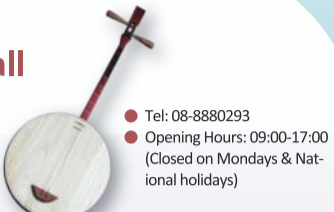
Hengchun Folk Song Hall

Folk song is a kind of distinctive music in Pingtung, and has been listed as an important intangible cultural heritage of the county. The Hengchun folk songs consist of seven tunes, "In Memory of the Past," "Spring All Year Round," "Goo-khang Minor," "Pingpu," "Niuweibang," "Maple Harbor (Fenggang) Minor," and "Keeping Herds Safe." You are welcome to listen to the most authentic local music tunes at the hall, especially "In Memory of the Past."