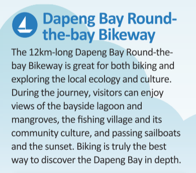
Dapeng Bay Round-the-bay Bikeway

The Pen Bay National Leisure Zone has diverse leisure resources, such as a waterfront recreational place, a car racing track, an international tourist hotel "Orient Resort Penbay", and an aircraft observation deck. Soon, this area will become a national-scale water sports resort.