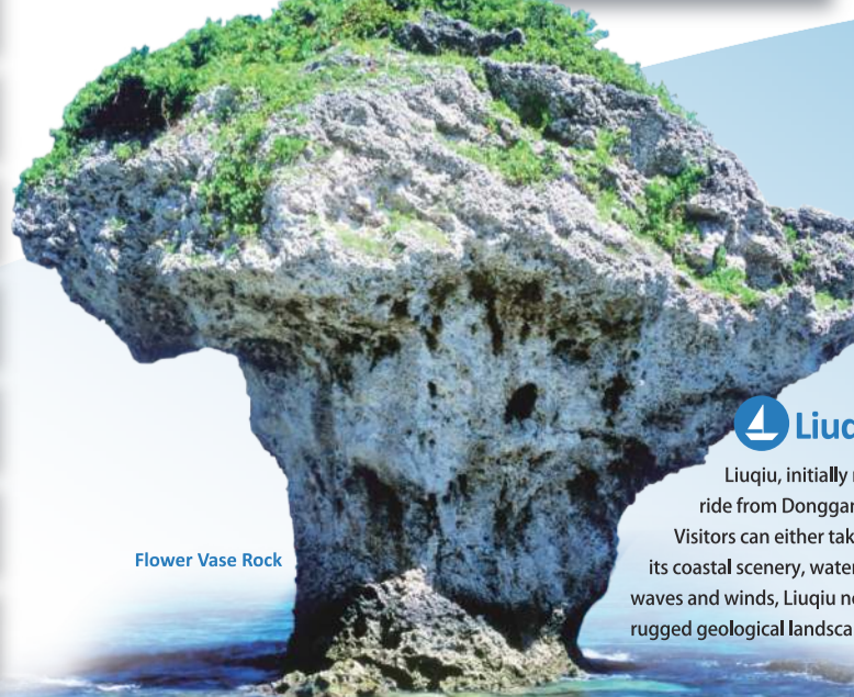
Flower Vase Rock

The 12km-long Dapeng Bay Round-the-bay Bikeway is great for both biking and exploring the local ecology and culture. During the journey, visitors can enjoy views of the bayside lagoon and mangroves, the fishing village and its community culture, and passing sailboats and the sunset. Biking is truly the best way to discover the Dapeng Bay in depth.