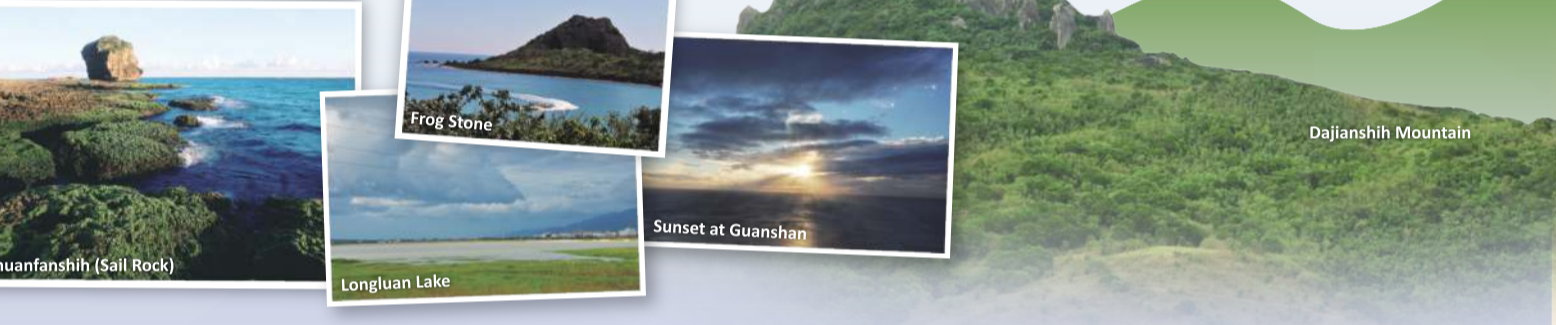
Chuanfanshih (Sail Rock) Longluan Lake Sunset at Guanshan Dajianshih Mountain

The rock got its name because it looks like a sailboat from afar. It is also called "Nixon's head" because it resembles former US president Richard Nixon when you look closer.