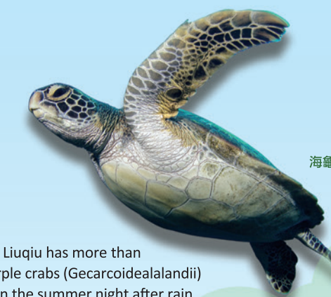
海龜明星 刀疤

Abundant in coral resources, Xiao Liuqiu has more than 200 stony corals (Scleractinia). Purple crabs (Gecarcoidealaandii) are all over the Wild Boar Trench in the summer night after rain. Rock-boring urchin (Echinometramathaei) and millipede brittle star (Ophiocomascolopendrina) are the most advantageous "spiny-skinned" animals (Echinoderms) which take shelter in rock crevices in intertidal zone. Green sea turtles are also plenty at Xiao Liuqiu. To observe the turtles, simply go to the scenic pavilion at the Beauty Cave!