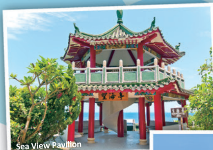
Sea View Pavilion

The Beauty Cave is composed of barrier reefs and is situated in a mountain with one side facing the sea. Inside the cave are rare, odd-shaped rocks, and outside the cave is a stretch of endless sea. Pay a visit to the Beauty Cave, and you will be enlightened by listening to the waves in tranquility and looking up to the rare rocks in awe. There are 13 major scenes: A Crooked Trail to Tranquility, A Higher Sky, Bat Cave, Valentines Platform, Fairy Cave, Fairy Spring, Yiran Garden, Labyrinth, A Thread of Sky, Banyan Rock Valley, Serenity Valley, Sea View Pavilion, and Beauty Cave. Each scene has its unique feature and all worth paying a visit.